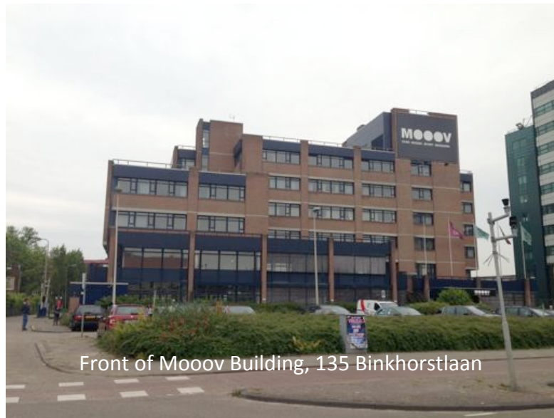
Front of Moov Building, 135 Binkhorstlaan

Moov is a spacious, vibrant village for Fitness, Music & Dance, where Virtuosi will be based in a new custom-built space for its students from the 2014/15 season onwards. Consisting of 8 smaller teaching studios and 2 larger 'band' rooms over a total of 300m 2 , Virtuosi will reside on the 2 nd floor of the former 'Koninklijke Luchtmacht' HQ. Featuring free parking & full amenities. You can also stop off for lunch or drinks at the Lunchboxx café any time in advance on the ground floor. With the increased space, Virtuosi is looking forward to providing exciting new opportunities to students, including recording capabilities and band/ensemble groups. Other offerings inside this village include Massage, Fitness & Dance Studios, including Tango, Salsa, Ballet & Bollywood Lyrical. For more information on the Moov initiative visit http://moov-den Haag.nl/