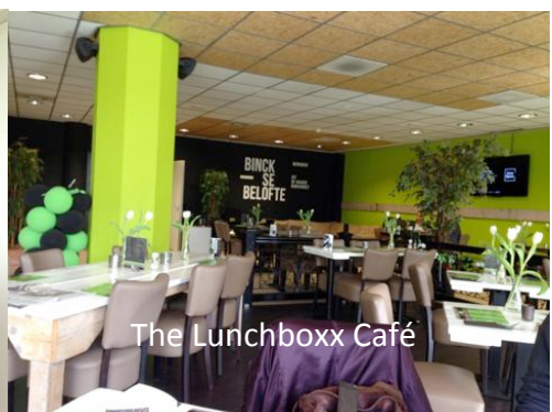
The Lunchboxx Café